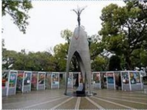
"This is our cry, this is our prayer: to create peace in the world" – Hiroshima children's peace monument