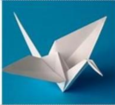
"I will write peace on your wings, and you will fly all over the world" – Sadako Sasaki , aged 12